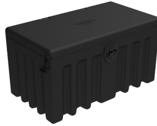
T36CHBMIN / 10004537 36" Black Chest Tool Box Assembly

Dimensions: 20" x 19" x 24" Weight: 27 lbs.