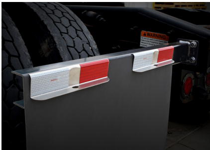
101227 / 10001563 Fast Flap Set