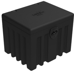
T24CHBMIN / 10004521 24" Black Chest Tool Box Assembly