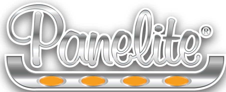
Official Logo (Horizontal Pumped)